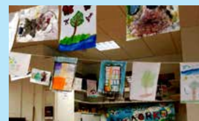
Some of the lovely pictures created at our new Art in the Park activity