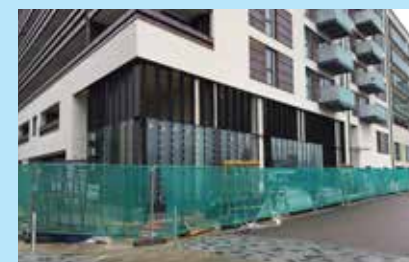
The new Engine Room is coming along