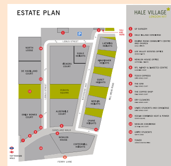
Example of new estate plan sign

These will include a digital entrance 'Welcome' totem, a map for drivers entering the Village, an interactive estates plan and improved parking information detailing how to pay by phone, card or cash.