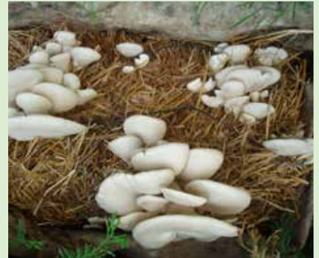
Find out how to grow edible mushrooms