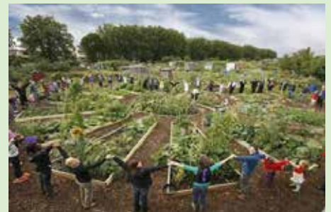
A chance to grow fruit and veg on your doorstep