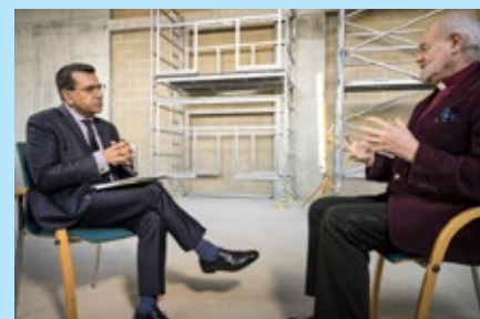
Martin Bashir and the Bishop