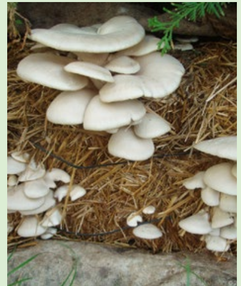
grow edible mushrooms