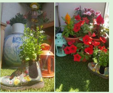
Winning Balconies in Bloom beautiful balcony space

Thank you to all participants for your entries and help towards making Hale Village's beautiful aesthetic and environmental contribution to the area.